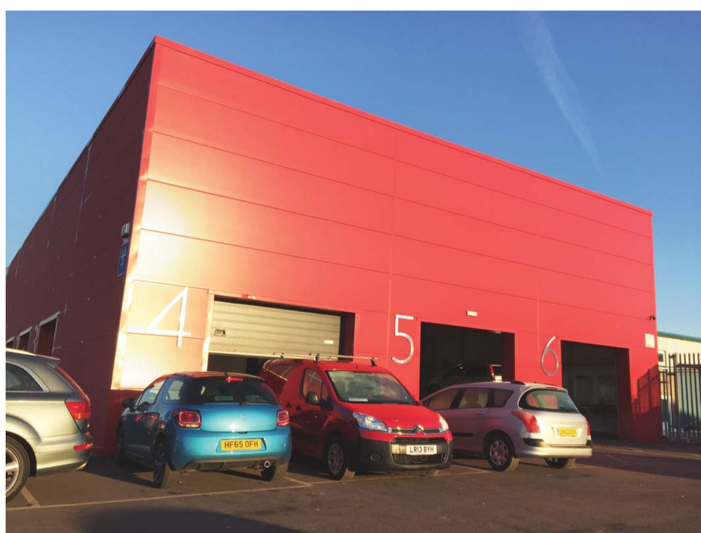
An example of a workshop and workshop parking