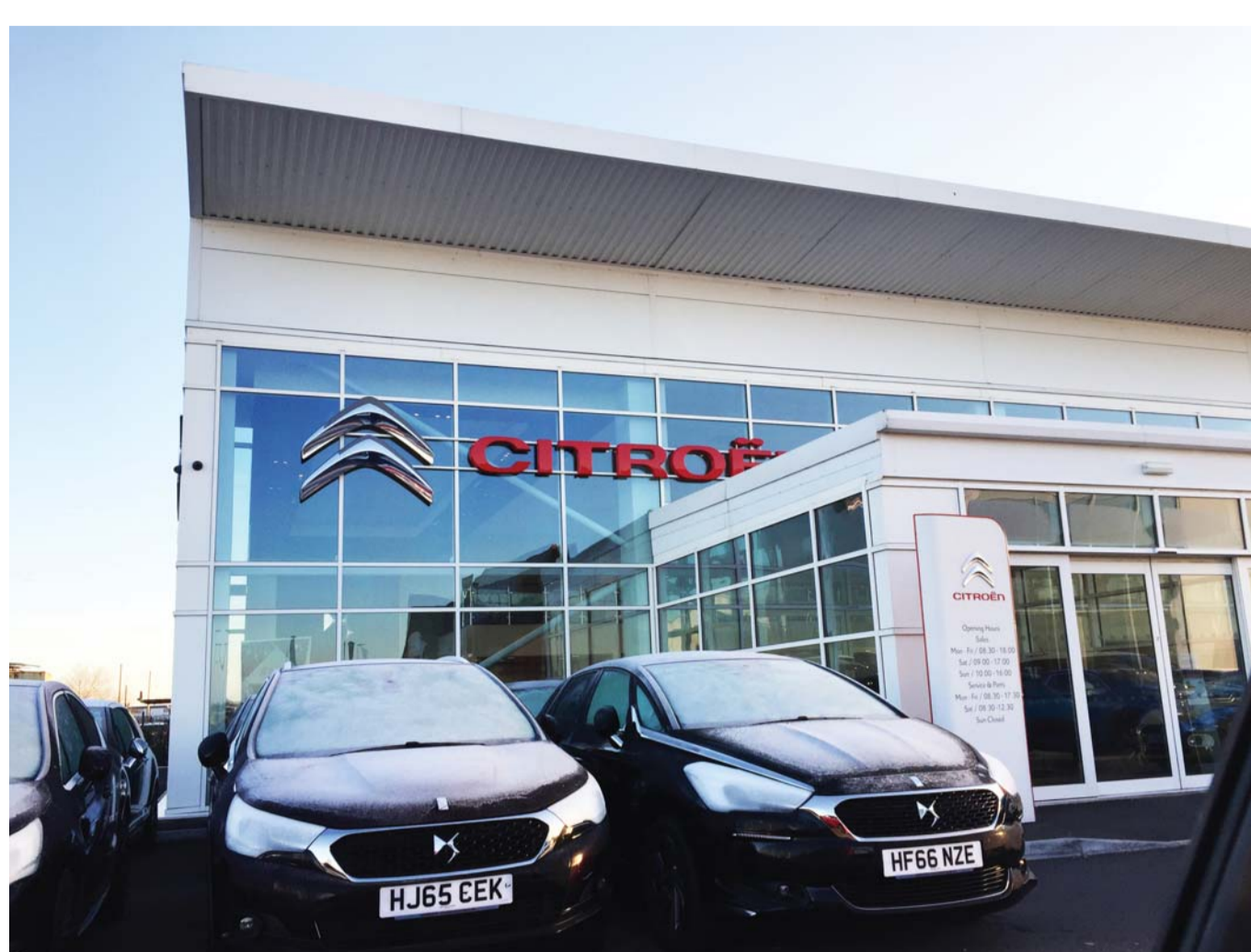
An example of a car showroom entrance

Tree planting will soften the edges and the access to the site at East Richardson Street.