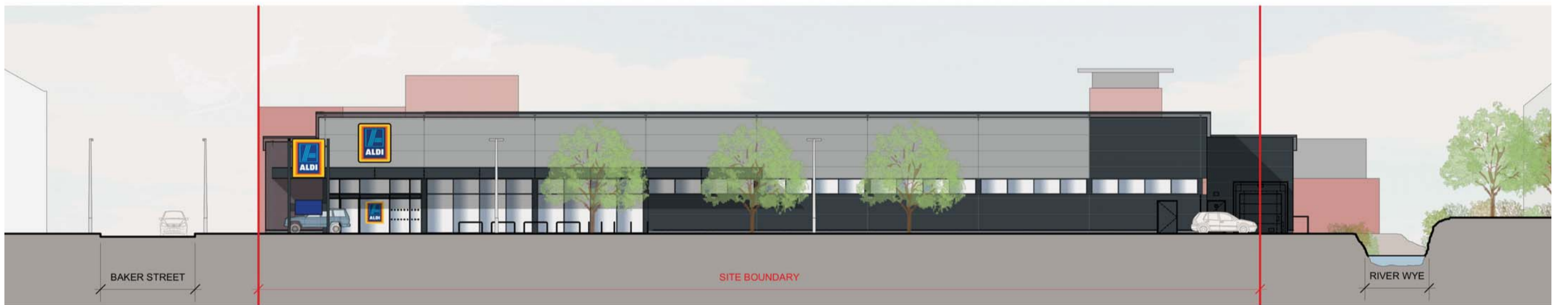
1. VIEW FROM DEVELOPMENT