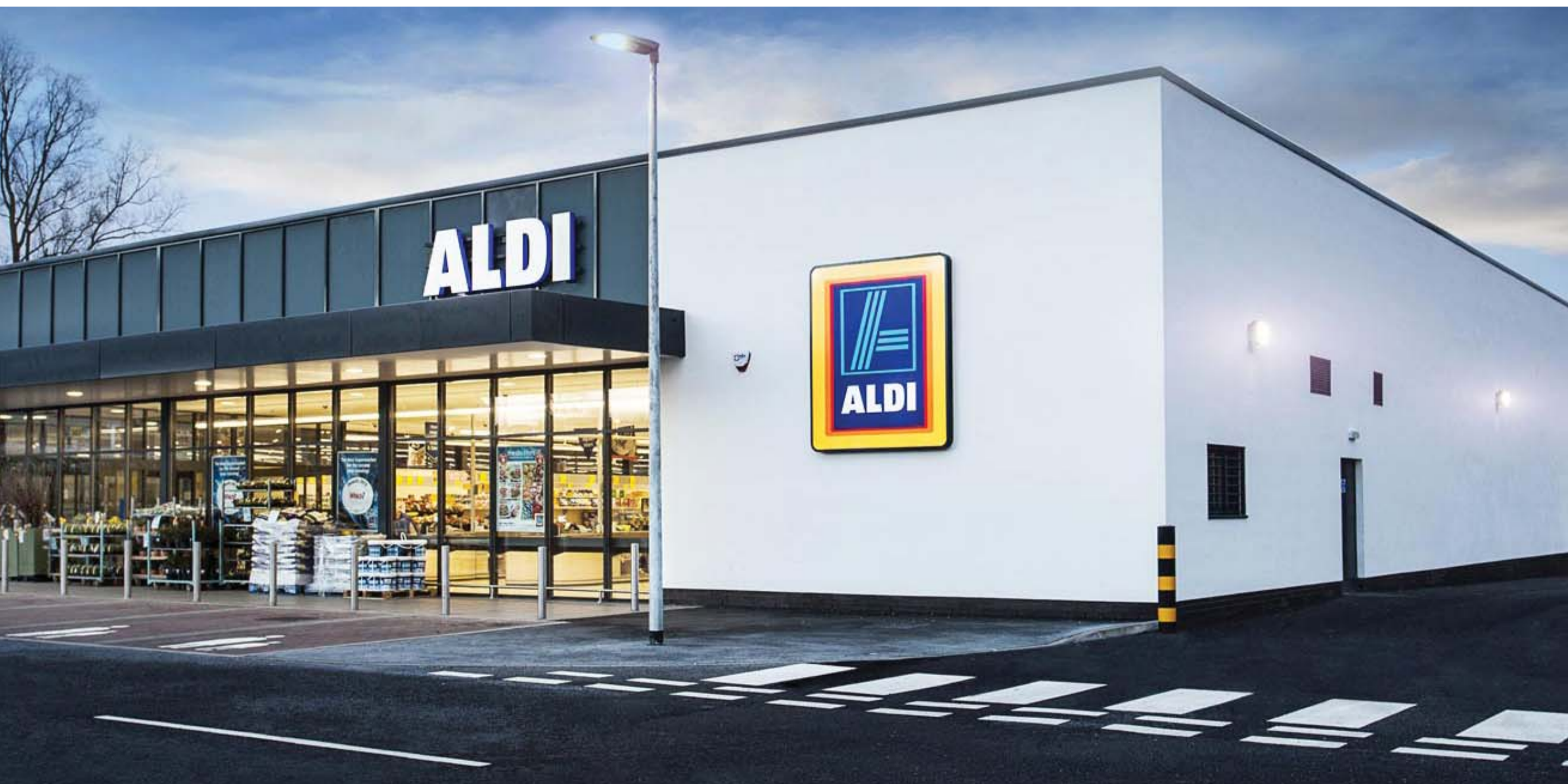
Elevations produced by Kendall Kingscott