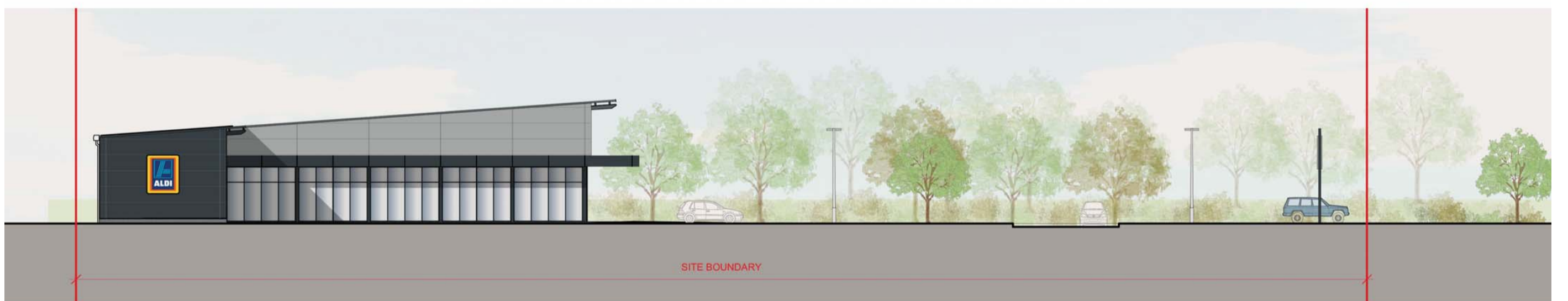
2. VIEW FROM BAKER STREET