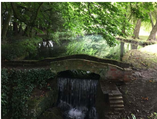
Fig 11: The bridge, weir, and the lake beyond

The park is notable for its tree plantings that include a belt beyond the lake which replaced the track shown on the first edition OS maps (fig 3): a path still follows its course amid the trees. The western end of the grounds is densely planted and the current carriage drive from the Alscot Lane/Longwick Road junction was laid out in the 1830s and included a carriage-turning circle in front of the house, still in everyday use.