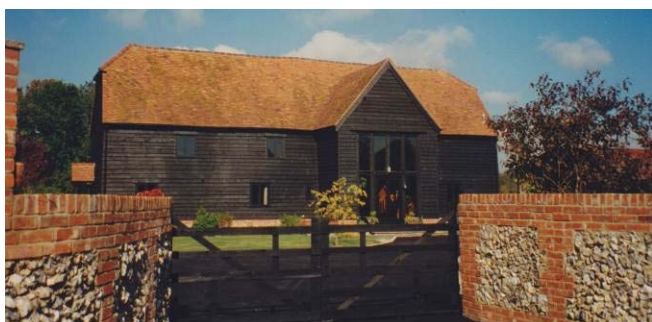
Fig 8: The barn in 1996, after conversion

Barn (now Harvest Barn) is a converted late 18th-century timber-framed weatherboarded barn of four bays. It has curved principal roof trusses and a roof with one-third hips. A scrum of modern attached farmbuildings was removed for the 1990 conversion and the wagon porch reinstated.