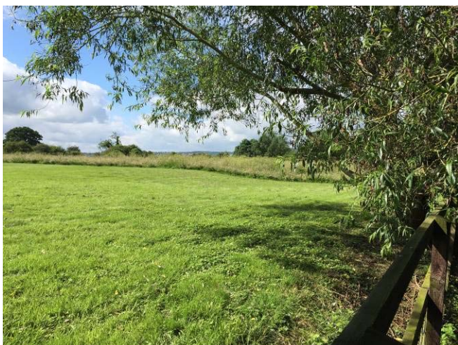
Fig 12: View south-west across south field

These fields are shown on the enclosure map and the 1877 OS map (fig 1), the southern one narrower. Their size indicates they were home closes that later became orchards and are thus decidedly different in character from the surrounding arable and pasture fields (figs 12 and 13).