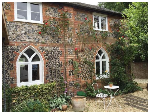
Fig 9: The Coach House, north elevation

The Coach House (formerly a service building to Alscot Lodge) The former coach house is a two-storey flint building with brick dressings and bands with three modern windows on the Lane elevation and a gable window, formerly a hayloft door. The best windows are to the coach yard or north elevation with Y-tracery in arched heads to the ground floor, the right hand one inserted into the blocked coach house doorway (fig 9).