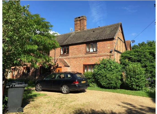
Fig 5: Alscot Farmhouse from the east

concrete tiles that pre-date the building's listing. Inside is much timber-framing and chamfered spine beams. Within the right hand bay the fireplace retains its original 17th-century three-centred brick arch.