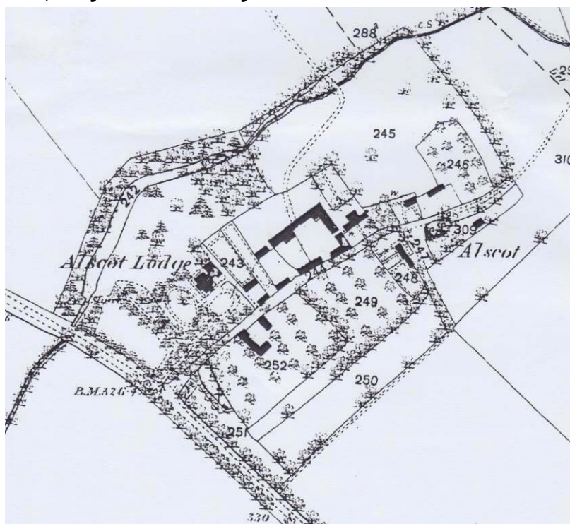
Fig 1: Alscot on the 1877 25 inch to the mile Ordnance Survey map

Reviewed and Updated, July 2016-January 2017