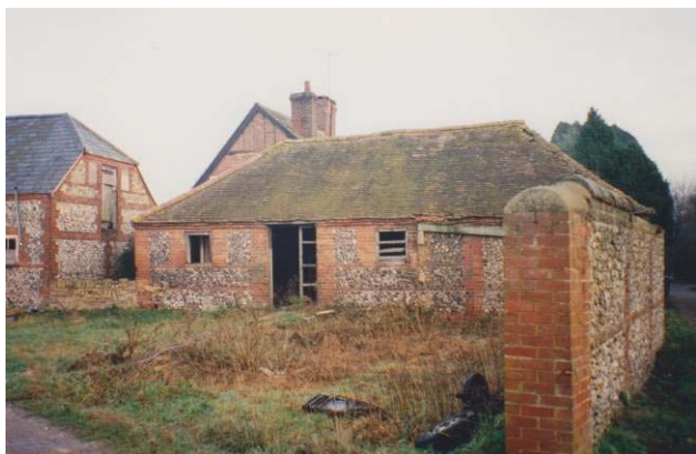
Fig 7: The stables and attached wall in January 1996 prior to conversion

farmbuilding has brick dressings and a hipped plain-clay tiled roof and was converted in 1997 as an annexe to Southerndown . Attached to its south-west angle is a run of brick and flint walling, the surviving rear wall of a long-demolished farmbuilding.