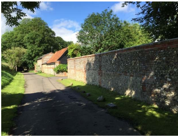
Fig 10: The walls fronting Alscot Lane looking south-west

stable building to Alscot Farmyard, a total of 175m of the 220m east-west length of the conservation area.