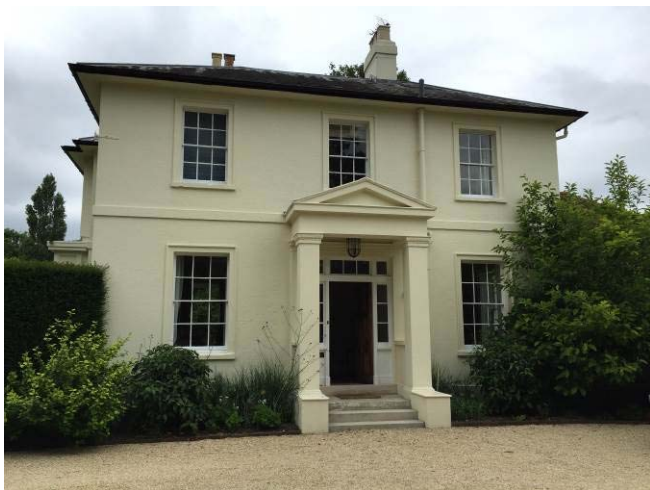
Fig 4: The south-east or entrance front

The south-west and north-west elevations are similar but with French casements and a bay window, uniting the house to its parkland in typical villa style.