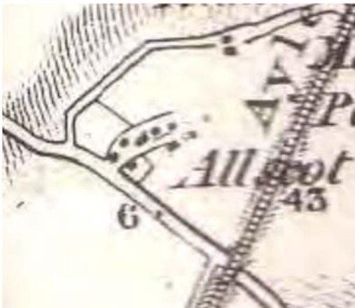
Fig 3: Ordnance Survey 1" to the Mile Map First Edition (1860s revised edition)

number as mentioned in the 13th-century enfeoffment referred to earlier but obviously rebuilt since the 13th century. These were the three at the east end of Alscot: Alscot Farmhouse, Alscot Cottage and The Pightle. Alscot Lodge did not then exist and the other buildings shown on the Ordnance Survey maps in figs 3 and 4 must have been farm buildings and the surveyor only indicated the dwelling houses on his plan.