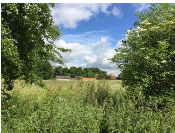
Fig 13: View across south fields from the public footpath to their south

The 1877 map shows farmbuildings opposite Alscot Lodge and roughly where the current field gate is situated. The west and south range had been demolished by the date of the 1898 OS and the east range after 1921. The northern and larger of the two fields had become an orchard by 1898.