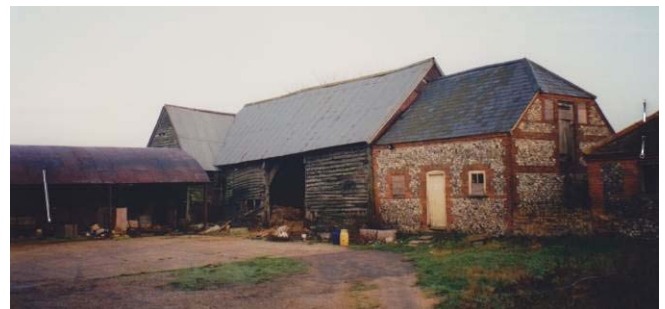
Fig 6: Barn and Dairy in January 1996 prior to conversion into a dwelling

Barn and Dairy (now part of Southerndown) This range, along with the separate stable building immediately to its south were converted into a dwelling in 1997 (fig 6). It has a former three-bay timber-framed and weatherboarded barn of about 1800 with a central wagon entry and a projecting bay to the left. An early 19th-century flint dairy of two storeys and two bays is attached. Fig 6 shows the building as it was before the conversion to Southerndown .