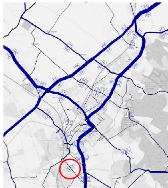
PM Flows (without Culverton Link)